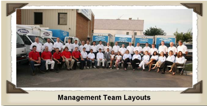
Management Team Layouts